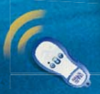
Convenient: AquaControl box and radio remote control