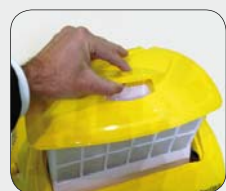
The Easy Filter Service makes emptying and cleaning of the filter fast and easy

dinotec GmbH Water and Pool Technology Spessartstr. 7 63477 Maintal/Germany Phone: +49(0)6109-6011-0 Fax: +49(0)6109-6011-90 E-mail: mail@dinotec.de www.dinotec.de www.niedrig-energie-pool.de